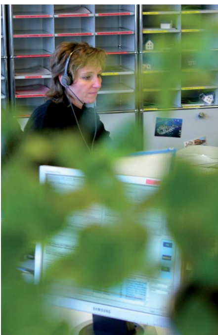
The number 140 is dialled up to 1500 times each day

to lead her horse into the barn. And as I already was there I washed also its fodder sack." And if it happens TCS patrols replace also the drive belt of the kneading machine of a bakery. Sam shrugs his shoulders laughing: "People have lots of different ideas. We are at their disposal, to meet them all."